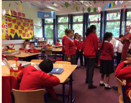
This is year 5/6