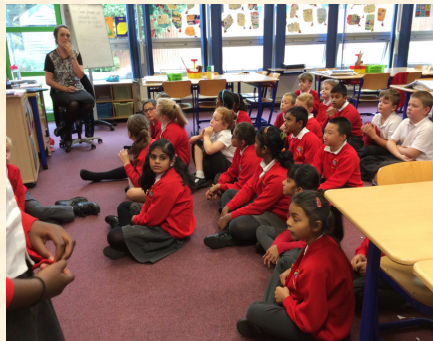
This is year 5