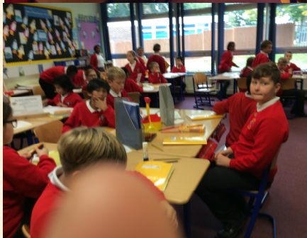
This is year 6